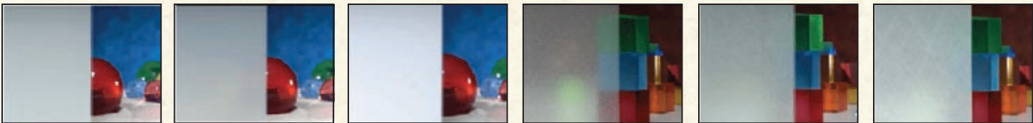
MILANO MILANO2 OPAQUE WEBSITE OSLO RIKYU SAGANO