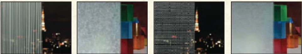
SHUTE VEGA VISTA YAMATO